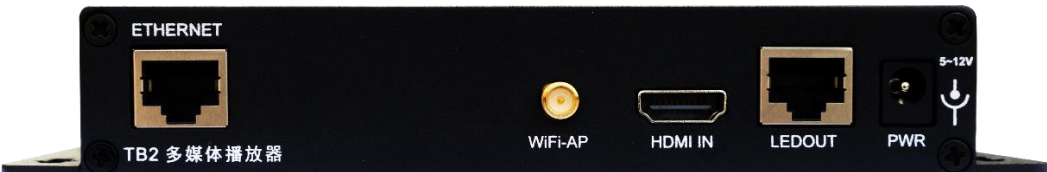
Figure 4-2 Rear panel of the TB2

Note: Product images provided in this document are for reference only, and the actual products shall prevail.