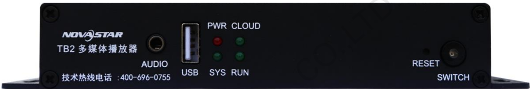
Figure 4-1 Front panel of the TB2

Note: Product images provided in this document are for reference only, and the actual products shall prevail.